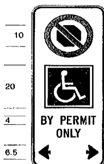
DISABLED STOPPING EXEMPTION Sign

Rb-95 30 cm x 75 cm Font Helvetica Bold Condensed Colour Interdictory Symbol – Red Reflective Symbol of Access and Symbol Border – Blue Reflective Legend & Border – Black Background – White Reflective